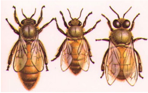
Queen Worker Drone ● Female ● Male