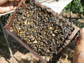
Apis cerana indica